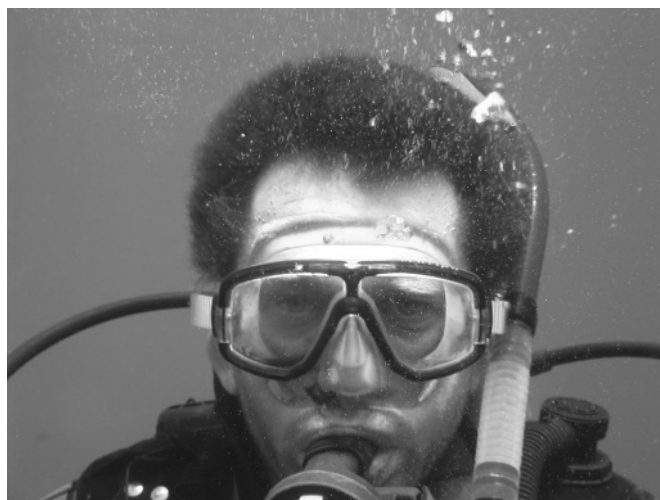
Figure 2 A diver with sinus barotraumata—blood is seen in the mask from sinus haemorrhage.

Unlike breath-hold divers, divers using breathing apparatus maintain relatively normal pulmonary volumes while diving but during ascent, the compressed gas in their lungs expands with the falling ambient pressure. If intrapulmonary gas is prevented from escaping as a result of a closed glottis, bronchospasm or gas trapping, excessive transpulmonary pressures will result. Differential alveolar compliance results in differential expansion of adjacent lung units causing focal shearing between vessels and airways and rupture of small airways and/or alveoli. Escaping gas can enter the pleural cavity (pneumothorax), mediastinum (mediastinal emphysema that may extend down into the retroperitoneum or appear around the neck as subcutaneous emphysema), pericardial cavity (pneumopericardium) or pulmonary venules (which transits the left heart to