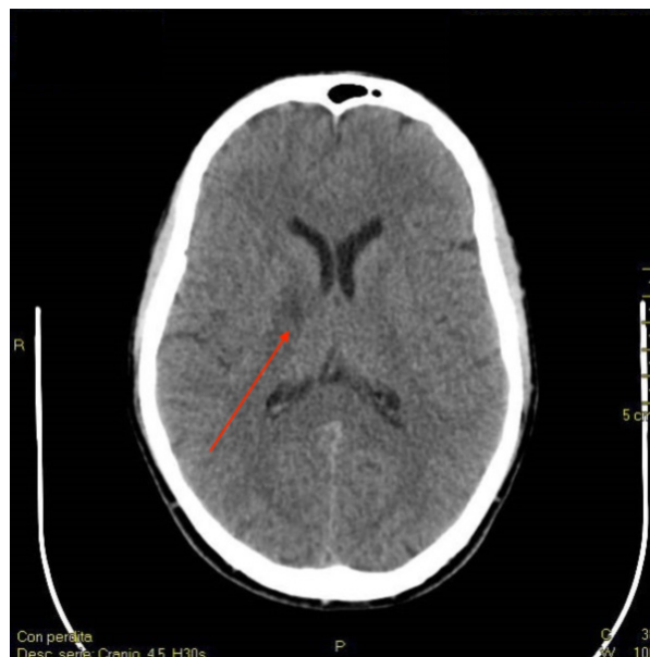
Figure 1. Brain CT scan showing a slight hypodense area in the right internal capsula (red arrow).

Our findings may suggest that BH diving, in associations with a thrombophilic state due to hyperhomocysteinemia,