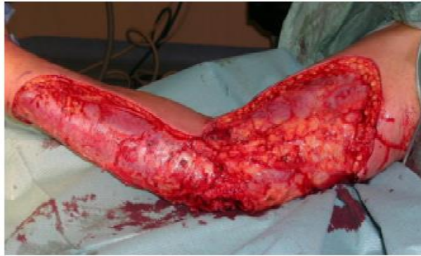
Fig. 7: Necrotizing bacterial dermo-hypodermatitis (DHBN) of the limb upper right: surgical excision