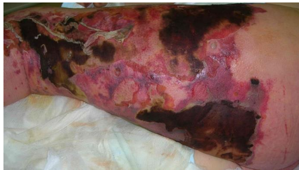
Fig. 8: Necrotic patches of the thigh