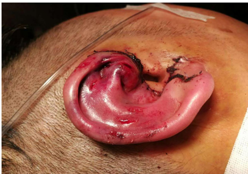
Figure 4 Day 8 after surgery.