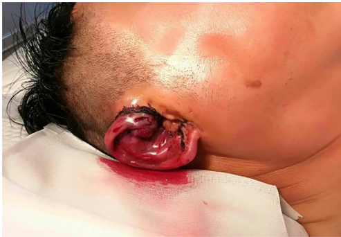
Figure 3 Day 2 postoperatively.