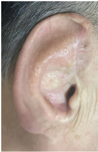
Figure 7 6 months after surgery.

twice a day, and instructed to perform ankle pump exercises to prevent the formation of thrombosis. Postoperatively, low molecular heparin calcium injection (4,100 iu) was administered subcutaneously twice daily, and after 7 days, it was changed to once daily for 6 days. After another 5 days, it was changed to once/8 h, and after a further 3 days, it was changed to once/12 h for 6 days.