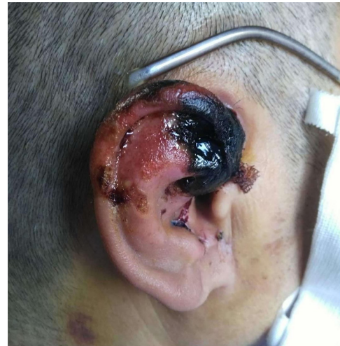
Figure 6 Day 15 after surgery.

was intermittently taken out of bed as prescribed by the doctor, and the ear was closely observed. At 6:30 a.m. on the 8 th postoperative day, the patient had a dark purple color on the upper edge of the replanted right ear after sitting up to eat ( Figure 4 ); these symptoms were slightly relieved after applying immediate massage and local incisional needle bleeding. At 9:00 a.m., the color of the upper edge of the ear was still purple, continuous blood-letting was performed, and 0.9% normal saline (500 mL) + sodium