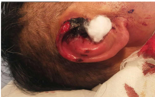
Figure 5 Day 11 after surgery.

was intermittently taken out of bed as prescribed by the doctor, and the ear was closely observed. At 6:30 a.m. on the 8 th postoperative day, the patient had a dark purple color on the upper edge of the replanted right ear after sitting up to eat ( Figure 4 ); these symptoms were slightly relieved after applying immediate massage and local incisional needle bleeding. At 9:00 a.m., the color of the upper edge of the ear was still purple, continuous blood-letting was performed, and 0.9% normal saline (500 mL) + sodium