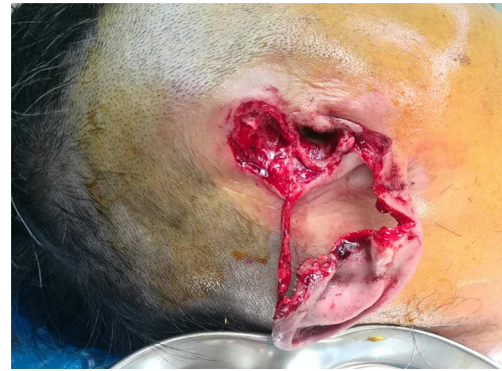
Figure 1 Before surgery.

microscope-assisted auricular replantation, targeted postoperative treatment, early intervention with hyperbaric oxygen therapy (2), and individualized nursing care. After 16 days of careful treatment, the patient was discharged from the hospital, and with continuous follow-up, the patient's ear shape and hearing reached the ideal standard. Early use of hyperbaric oxygen therapy after surgery is a unique treatment method of this case, which plays a vital role in the reconstruction of microcirculation, especially the recovery of blood circulation and survival of the severed ear, and is worth promoting. The meticulous management of the medical and nursing care ensured the success of the operation and is worthy of promotion. We present the following article in accordance with the CARE reporting checklist (available at https://atm.amegroups.com/article/view/10.21037/atm-22-6441/rc ).