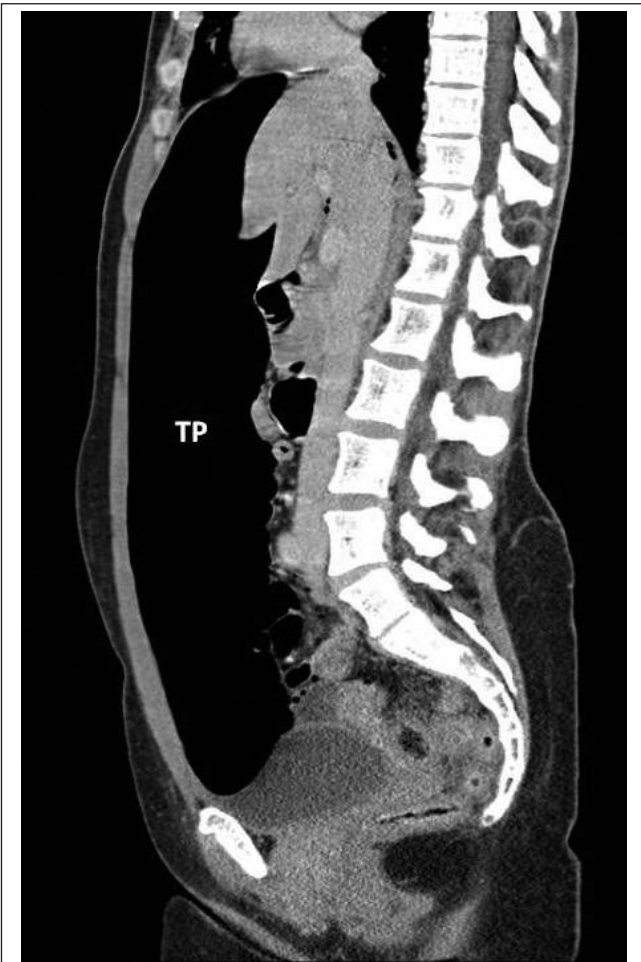
Figure 2 Computed tomography with oral contrast showing pneumoperitoneum with compression of intra-abdominal viscera

ACS is a serious illness characterised by organ dysfunction secondary to intra-abdominal hypertension. The aetiology