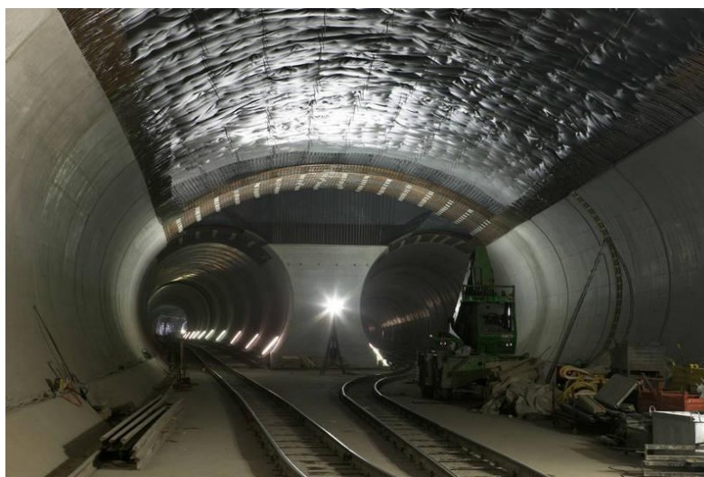
Figure 5: Gotthard base tunnel

The project consists of two single-track tunnels. It is part of the Alp Transit project, also known as the New Railway Link through the Alps (NRLA), which includes the Lötschberg Base Tunnel between the cantons of Bern and Valais and the under construction Ceneri Base Tunnel (scheduled to open late 2019) to the south. It bypasses the Gotthardbahn, a winding mountain route opened in 1882 across the Saint-Gotthard Massif, which is now operating at capacity, and establishes a direct route usable by high-speed rail and heavy freight trains.