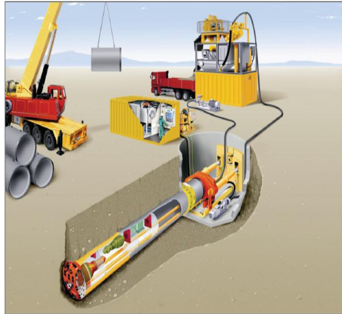
Figure 2: Tunneling operations

Except these stages or operations there are some other sub operations which are necessary to do like to suction water and other waste out of tunnel, certain safety operations...etc.