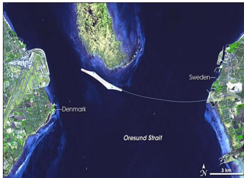
Figure 6: Oresund tunnel

The crossing of the strait is completed by a 4 km (2.5-mile) underwater tunnel, called the Drogden Tunnel, from Peberholm to the Danish island of Amager. The term Øresund Bridge often includes this tunnel.(shown in figure 6)