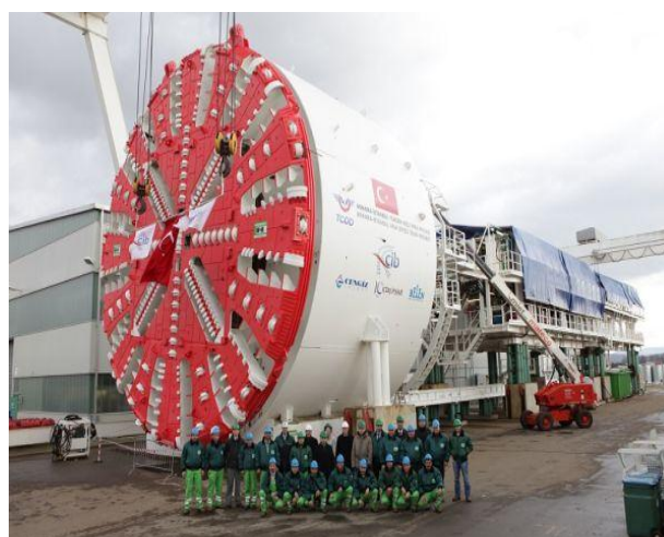
Figure 3: TBM; Tunneling boring machine

Tunnel diameters can range from a meter (done with micro-TBMs) to 19.25 m to date. Tunnels of less than a meter or so in diameter are typically done using trenchless construction methods or horizontal directional drilling rather than TBMs. Tunnel boring machines are used as an alternative to drilling and blasting (D&B) methods in rock and conventional "hand mining" in soil. TBMs have the advantages of limiting the disturbance to the surrounding ground and producing a smooth tunnel wall. This significantly reduces the cost of lining the tunnel, and makes them suitable to use in heavily urbanized areas.