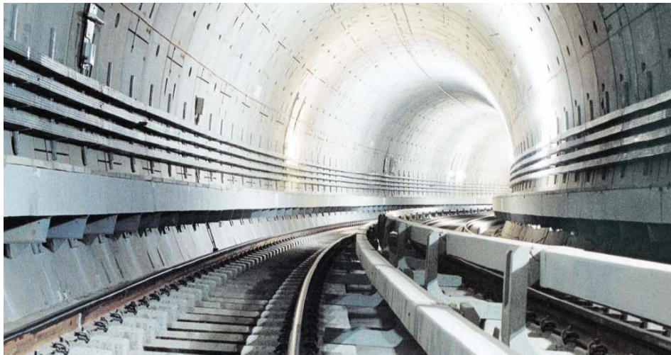
Figure 1: Railway tunnel

To construct any tunnel through river or through a hill, or a underground tunnel, There are certain operation or steps which are to be followed or to be performed, which are called various tunneling operations.