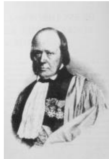
Fig. 4. Milne-Edwards