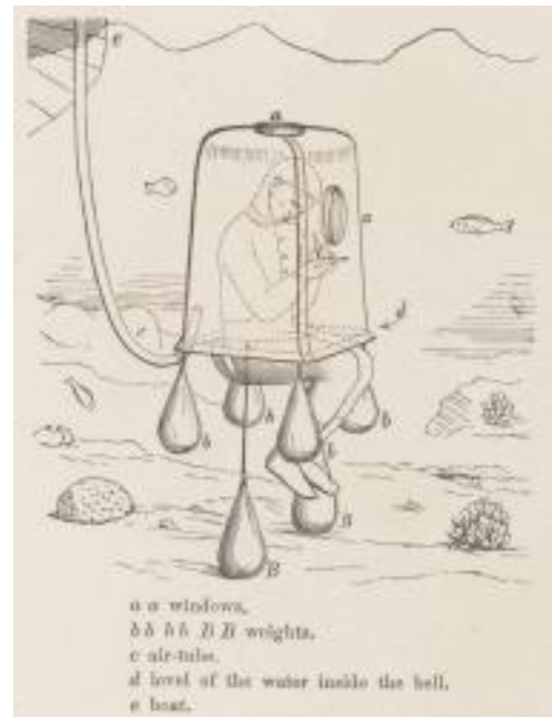
Fig. 5. Underwater painting (Ceylon) of Ransonnet (Ransonnet, 1867, Plate XXV)