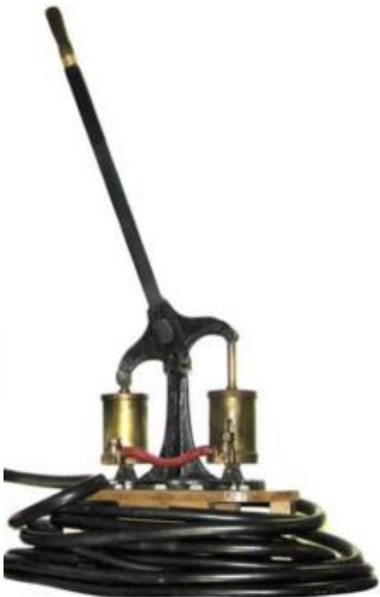
Fig. 3. Manual 'wobble' pump in use with the Miller-Dunn diving helmet

Miller-Dunn also developed compact double cylinder pumps in three improving designs for each Divinhood Style (Dutton, 2011). These pumps were operated by one person at the surface by moving a 1.5 m stick back and forth (Fig. 3). Maximum pressure was enough to dive to a depth of 15 m.