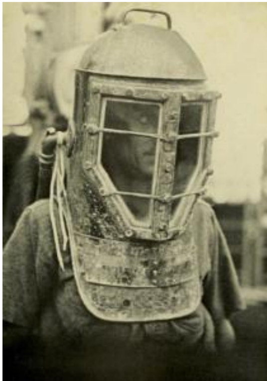
Fig. 2. The Miller-Dunn open diving helmet Style2, a model popular among marine biologists, here worn by William Beebe (from Beebe, 1926)

In order to observe in a horizontal direction and at a greater depth, an open diving helmet may be used (Gudger, 1918; Conklin, 1933). It is shaped cylindrical or like a rectangular box and most often it has a handle on top to assist the diver when not under water. The helmet rests on the diver's shoulders and enables walking on the seabed while viewing through a transparent window. Air is pumped from the surface into the helmet to a pressure equal to the surrounding water. Surplus air escapes from below the rim of the helmet, giving surface operators an indication of the diver's location. The diver has to be careful not to bend over too much, as more air will escape from the back side of the helmet. When pumping is inadequate, the air quality will deteriorate due to oxygen consumption and the water level inside the helmet will rise. In this case, it is relatively easy to throw off the helmet and swim to the surface, but attention should be paid to exhale in order to prevent lung burst.