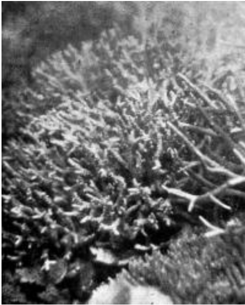
Fig. 10. Part of the reef with Acropora species at Hoorn (Ajer Besar). Underwater photograph by Verwey at a depth of 5 m (From: Verwey 1934)

1931). Verwey also succeeded in underwater photography (Fig. 10). On 8 July 1931 he ended his reef studies in the field, by visiting several Islands (without diving) for the last time.