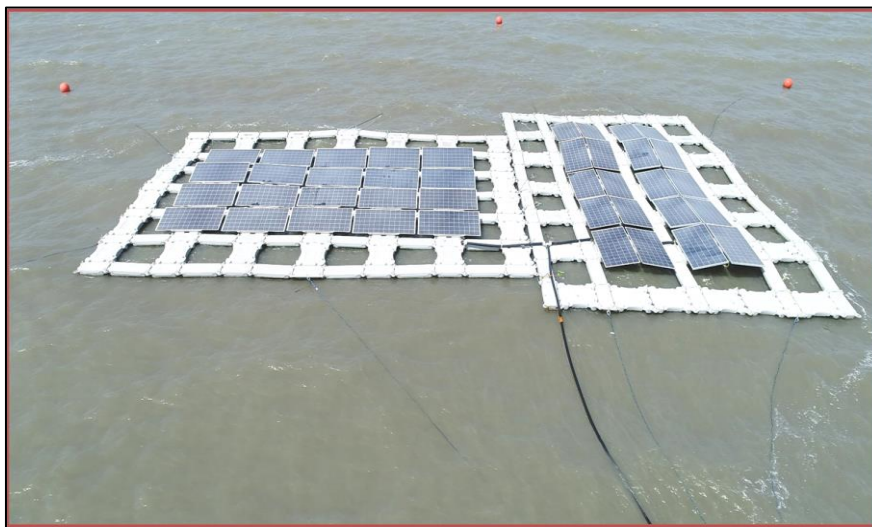
Figure 2. FPV installation in Laguna de Bay (LLDA-RMDD).

Table 1 shows some information about the four (4) pilot project projects and their beneficiaries. None of the project developers fully utilized the maximum one-hectare allocation. The FPV installations occupied an area ranging from 120 m 2 to 240 m 2 . The savings in electricity cost were much appreciated by the beneficiaries, although they are not really net savings since the cost of the FPV system including manpower cost were shouldered by the project developers. Likewise, it served as a communication tool to introduce the technology to the communities around the lake and to demonstrate the benefits of using this type of renewable energy.