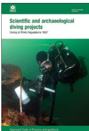
L107 (Second edition) Published 2014

This Approved Code of Practice (ACOP) and associated guidance provides practical advice and sets out what you have to do to comply with the requirements of the Diving at Work Regulations 1997 (the Diving Regulations).