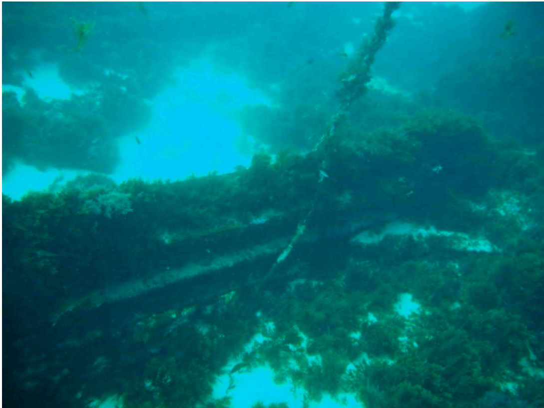
Figure 2. A chain moored on an iron shipwreck.

It is urgent that archaeologists, historians and heritage professionals take an active and direct part in the design of these recreational diving activities, and in their implementation. If this trend is not regulated and supervised, we run the risk that underwater archaeology becomes, or becomes again, an activity of exploration and hobby, but not of protection and research. It is important not only to have a legal framework to develop these activities and protect the heritage but also that the administration and relevant institutions properly supervise and monitor these types of initiatives, whether public or private, to ensure the survival of the heritage and the correct transmission of the associated values.