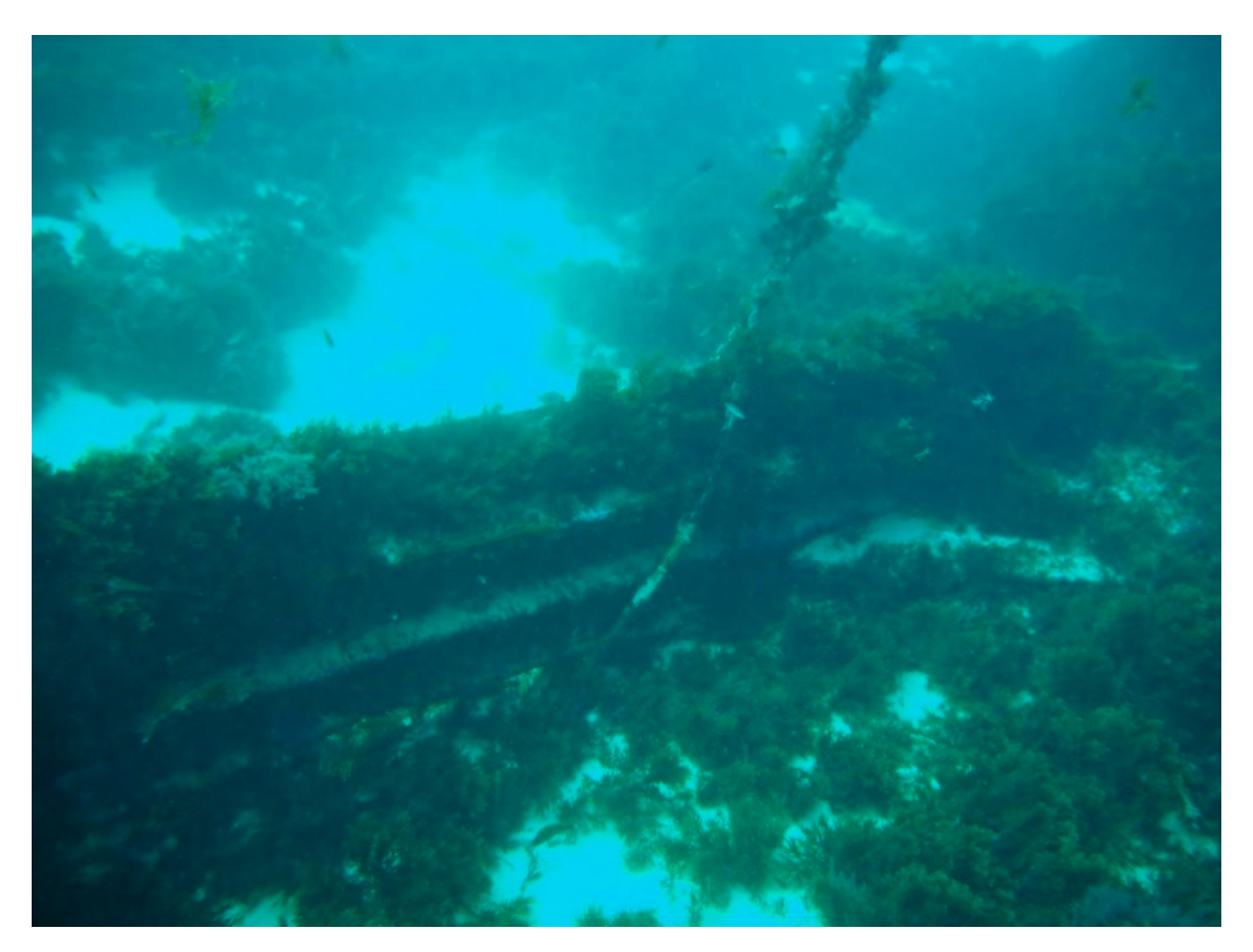
Figure 2. A chain moored on an iron shipwreck.

It is urgent that archaeologists, historians and heritage professionals take an active and direct part in the design of these recreational diving activities, and in their implementation. If this trend is not regulated and supervised, we run the risk that underwater archaeology becomes, or becomes again, an activity of exploration and hobby, but not of protection and research. It is important not only to have a legal framework to develop these activities and protect the heritage but also that the administration and relevant institutions properly supervise and monitor these types of initiatives, whether public or private, to ensure the survival of the heritage and the correct transmission of the associated values.