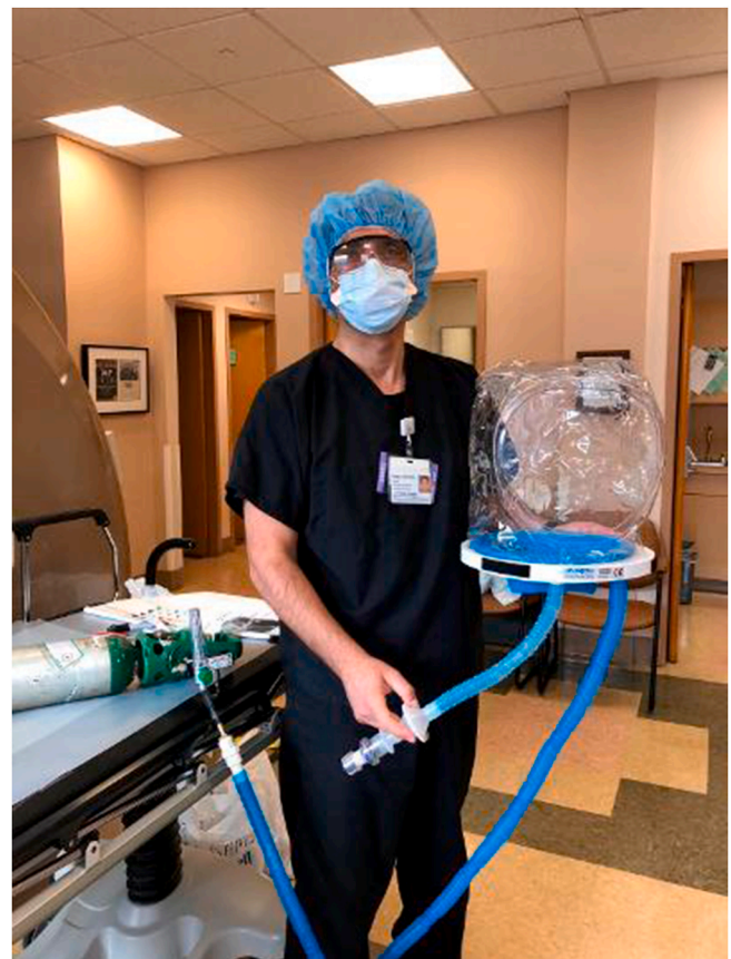
Fig. 1. Oxygen Hood Delivery System with HEPA Filter and Optional Positive End Expiratory Pressure (PEEP) Adaptor. The apparatus is attachable to flowmeters in negative pressure isolation rooms.