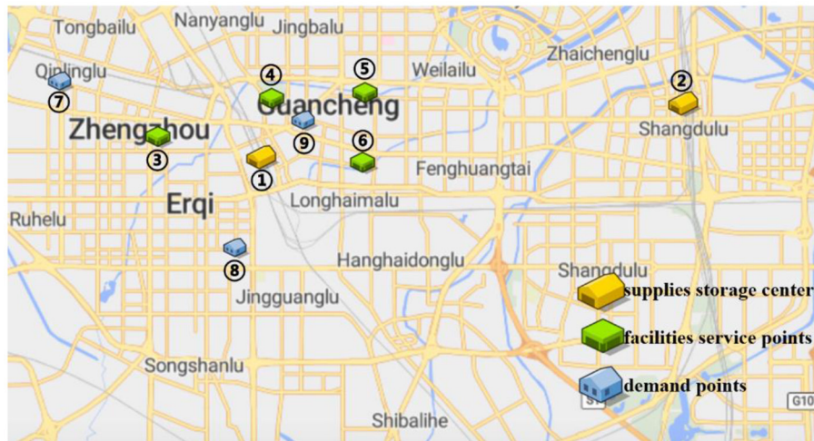
FIGURE 1 | Locations of three types of mobile emergency stations in Zhengzhou.

relationship of the codes corresponding to the best emergency plan, and the accuracy of local optimization can be improved.